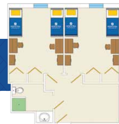
Double suite-style Shared bathroom and common area