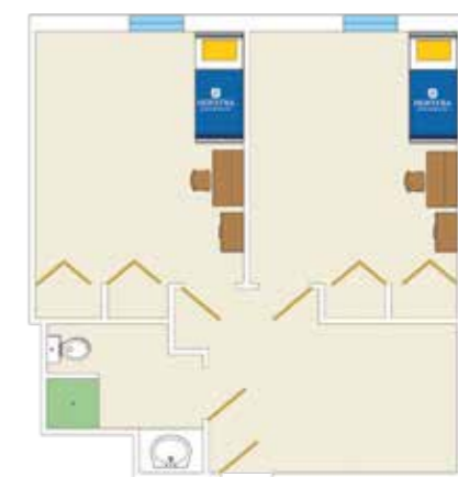
Super single suite-style Shared bathroom